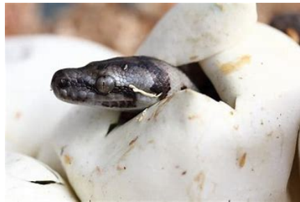
Carpet Python Hatching

With proper care, Carpet Pythons can live 30+ years in captivity.