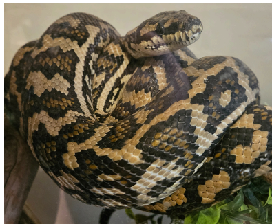
Polyester 'Poly' the Carpet Python

Carpet Pythons can be a very docile snake species once they have been trained. While they may be nippy and defensive as juveniles, they can be tamed down to be very calm and tolerant snakes. It's helpful to use tools, such as snake hooks, when training your snake, especially to prevent feeding responses.